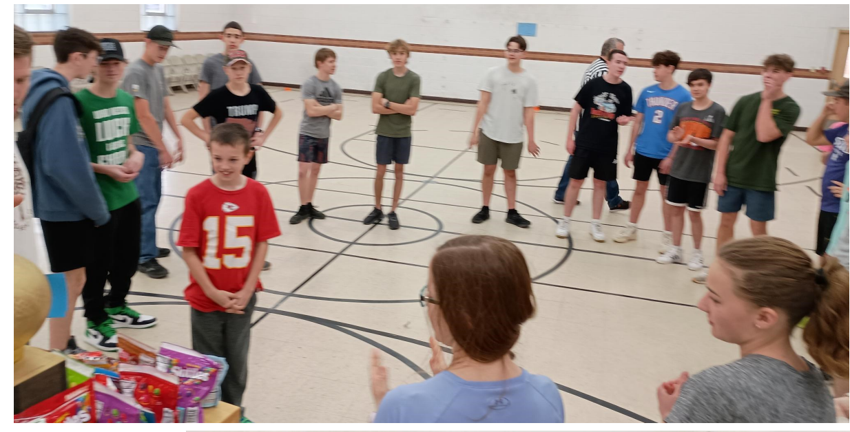
Learning the rules and checking out the prizes.